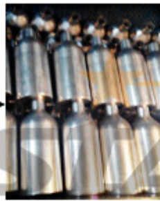
shape after extrusion