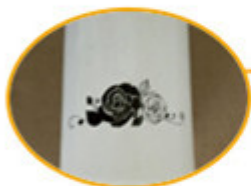
various printing methods