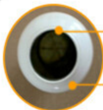
food grade safety