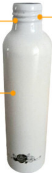
99.7% pure aluminum