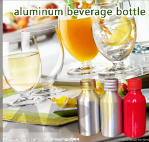
aluminum beverage bottle