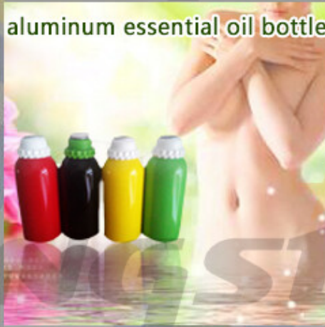
aluminum essential oil bottle