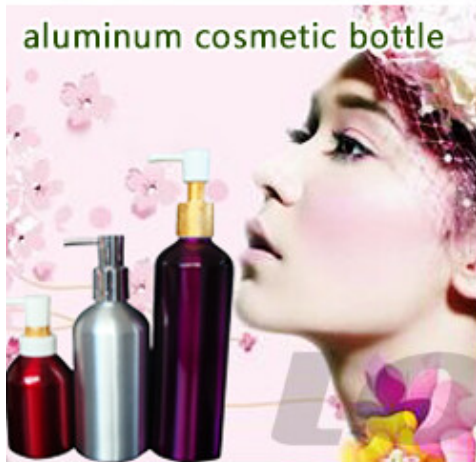
aluminum cosmetic bottle