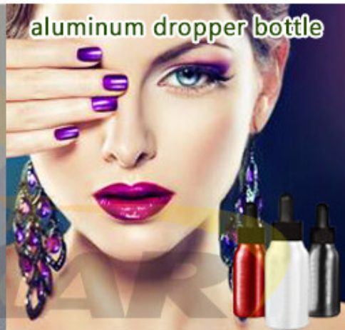
aluminum dropper bottle