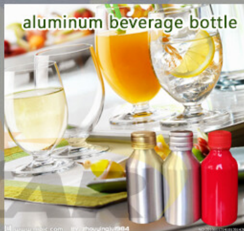
aluminum beverage bottle