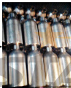
shape after extrusion