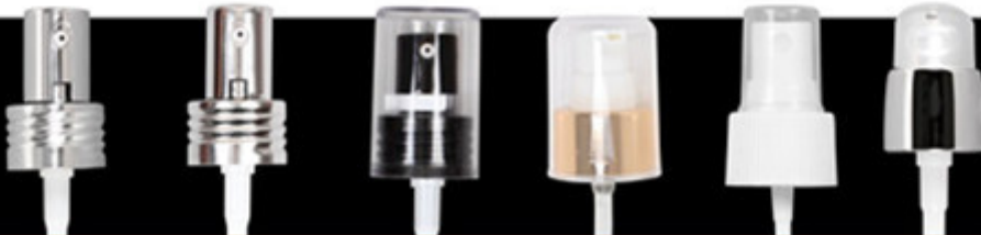
LSB-006 LSB-007 LSB-008 LSB-009 LSB-010 LSB-011