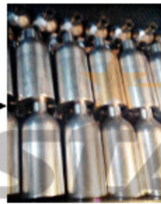
shape after extrusion